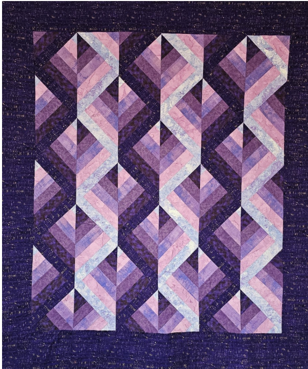
Mirror Mirror Quilt