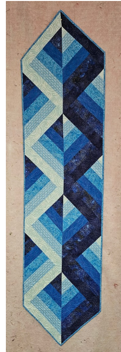
Mirror Mirror Table Runner